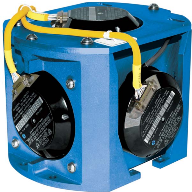
MK31 IMU incorporating Honeywell GG1320 ring laser gyros.