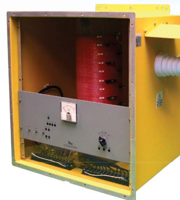
PC-1000 Antenna Tuning Unit