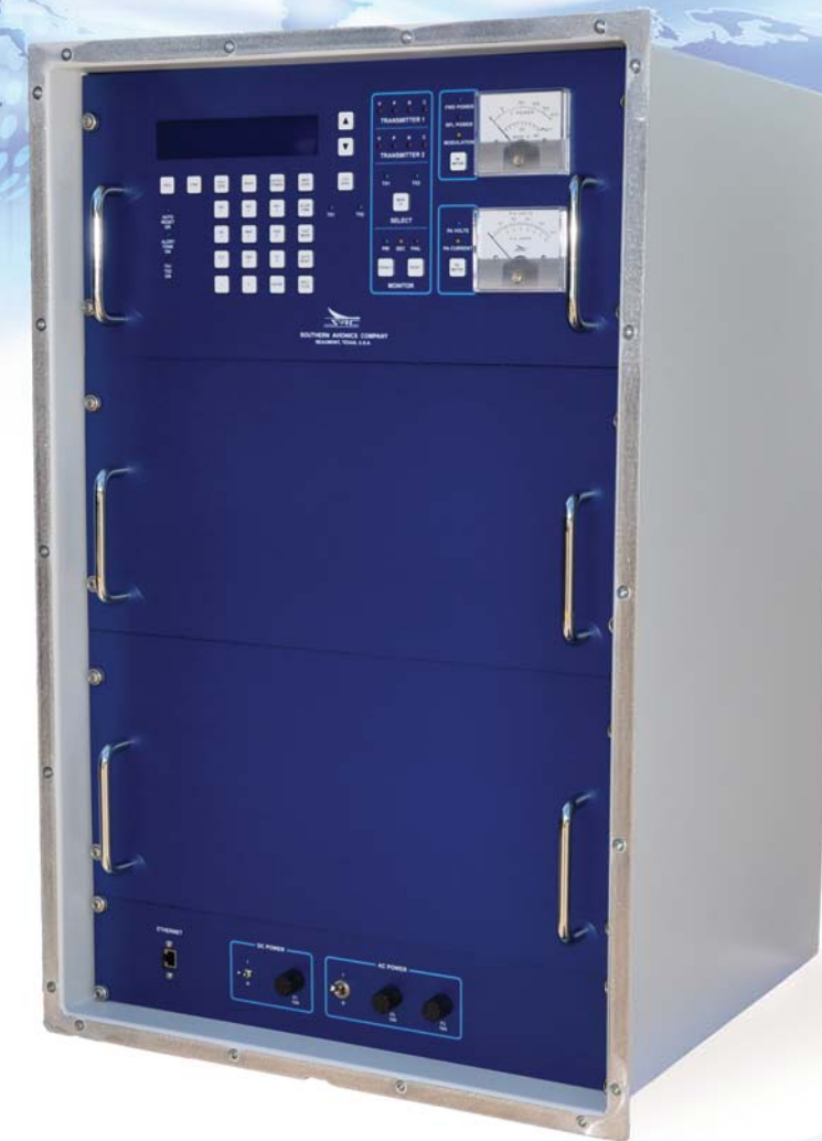
SE Outdoor IP66 Cabinet