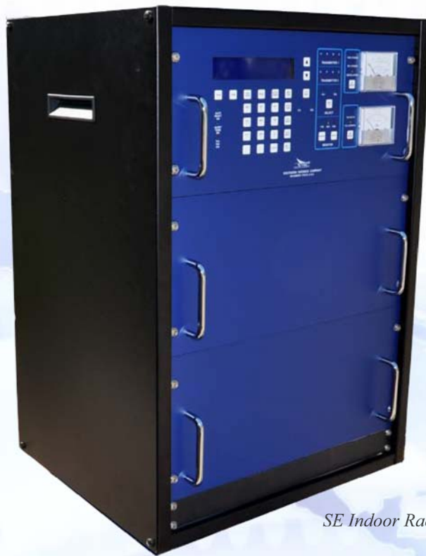
SE Indoor Rack Cabinet

Due to our 47 years of experience, superior quality products, and commitment to long-term customer satisfaction, Southern Avionics is recognized as one of the foremost manufacturers of NDB equipment in the world.