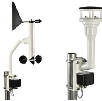
Wind speed and direction sensors