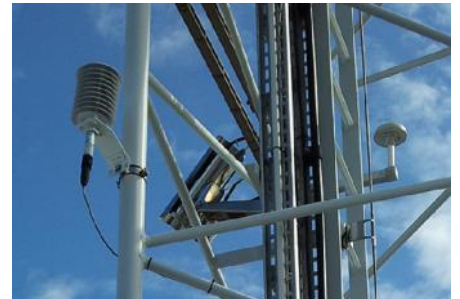
Temperature, Humidity and Dew Point