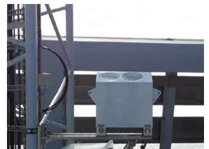
Cloud height sensor