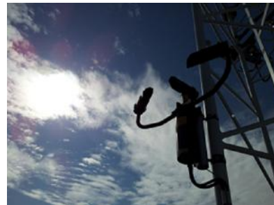
Visibility and Present Weather sensor