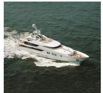
OMC-160 installed on mega yacht