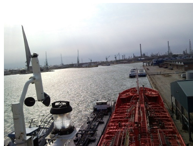
OMC-160 installed on tanker