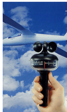
For sailplane use